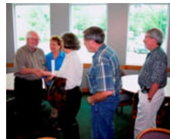
Guests lined up to give their best wishes