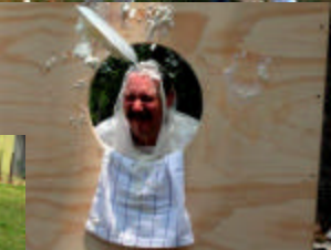
Volunteers braved the pie toss contest.