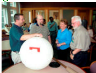
A unique mailbox for TL