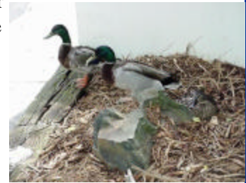
Ms. Duck's new beaux

Within the past few weeks, Ms. Duck and her suitors have not been around the building. Speculations are that they have moved to a cooler place close to the ponds on campus.