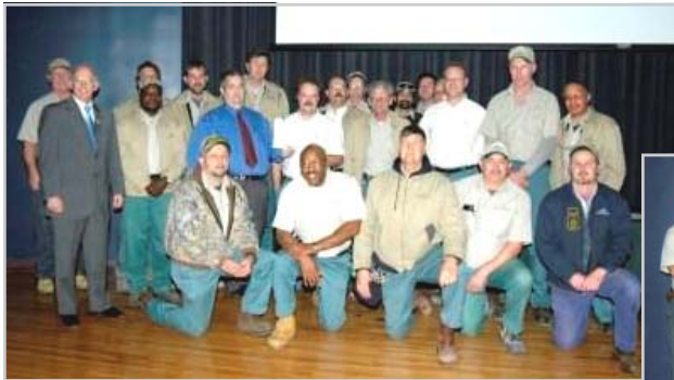
CAB Opening Team