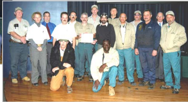
Main Street Market Team