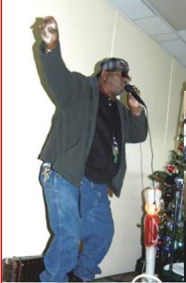
Facilities Management held it's annual Holiday Party on December 16, 2004 in the Residence Dining Hall. Approximately 175 staff, retirees and guests attended the event.