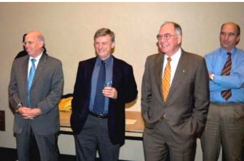
Representatives from various departments campus-wide attended the farewell reception. Best Wishes to CP!