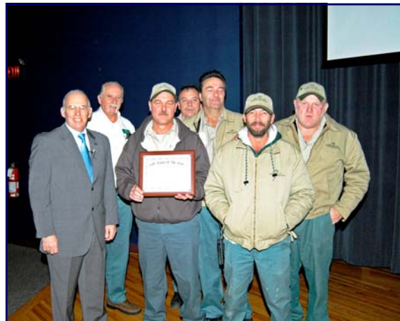
Preventive Maintenance—Shop 18