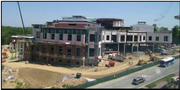
Student Union