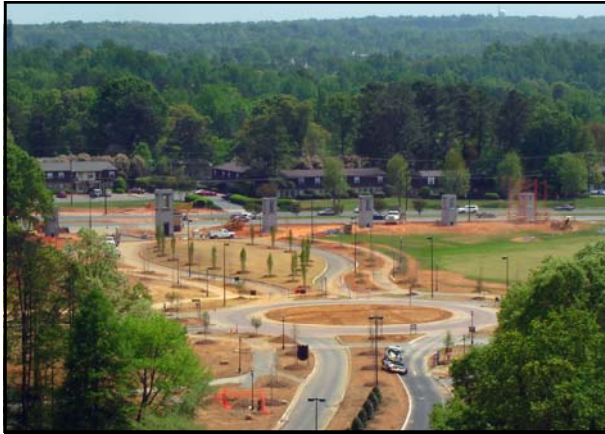
New Front Entrance

As another academic year draws to a close, I want to thank the entire Facilities Management Team for the great job you are doing in planning, building, operating and maintaining UNC Charlotte. The year has been fast paced and dynamic. Together, we have faced and overcome numerous challenges. I commend you on your perseverance and hard work.