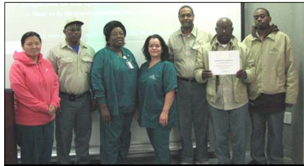
Housekeeping - Charlotte Research Institute Area

The following employees received an applause card: