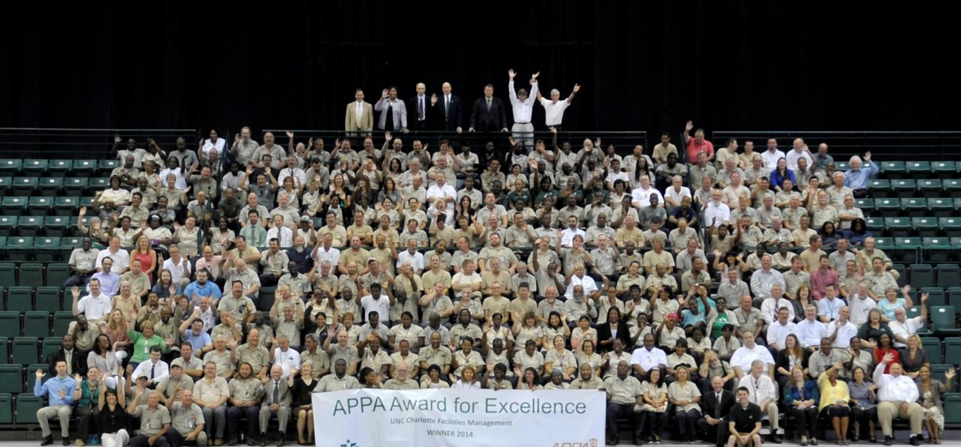
All Employees Meetings July 18 and 26, 2018 Fiscal Year 2018 Fourth Quarter Employee Recognition