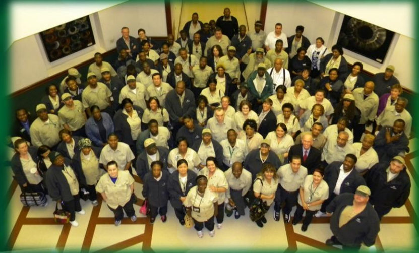
Second and Third Shifts

All Employees Awards Presented April 23 & 25, 2013 Fiscal Year 2013 Third Quarter Recognition