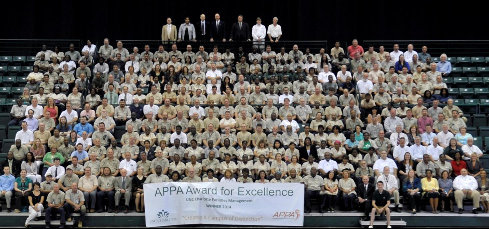
All Employees Staff Recognition Presented on July 29, 2015 Fiscal Year 2015 Fourth Quarter Recognition