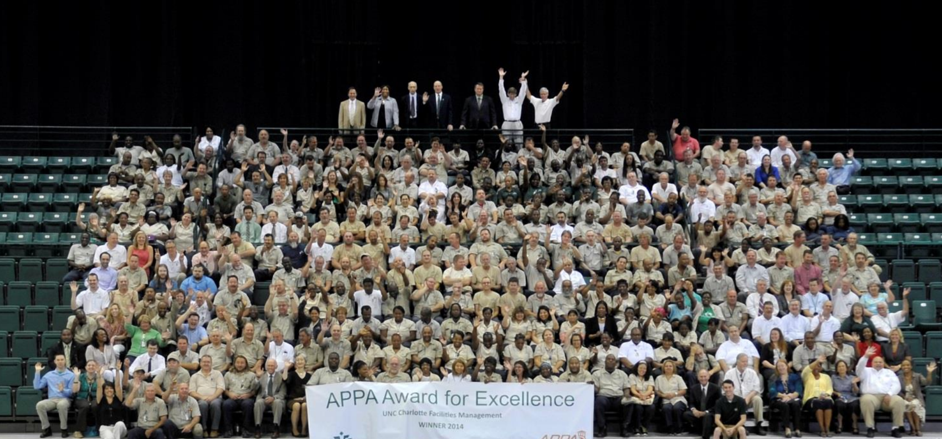
All Employees Meetings July 26, 2016 Fiscal Year 2016 Fourth Quarter Employee Recognition