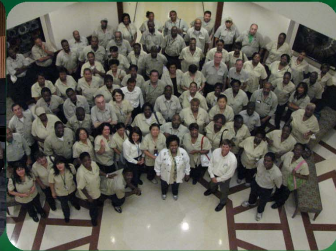
Second and Third Shifts

All Employees Awards Presented October 13, 2011 (First Shift) October 18, 2011 (Second & Third Shifts) Fiscal Year 2012 First Quarter Recognition