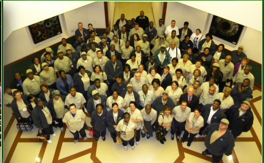
Second and Third Shifts

All Employees Awards Presented October 15 & 23, 2013 Fiscal Year 2014 First Quarter Recognition